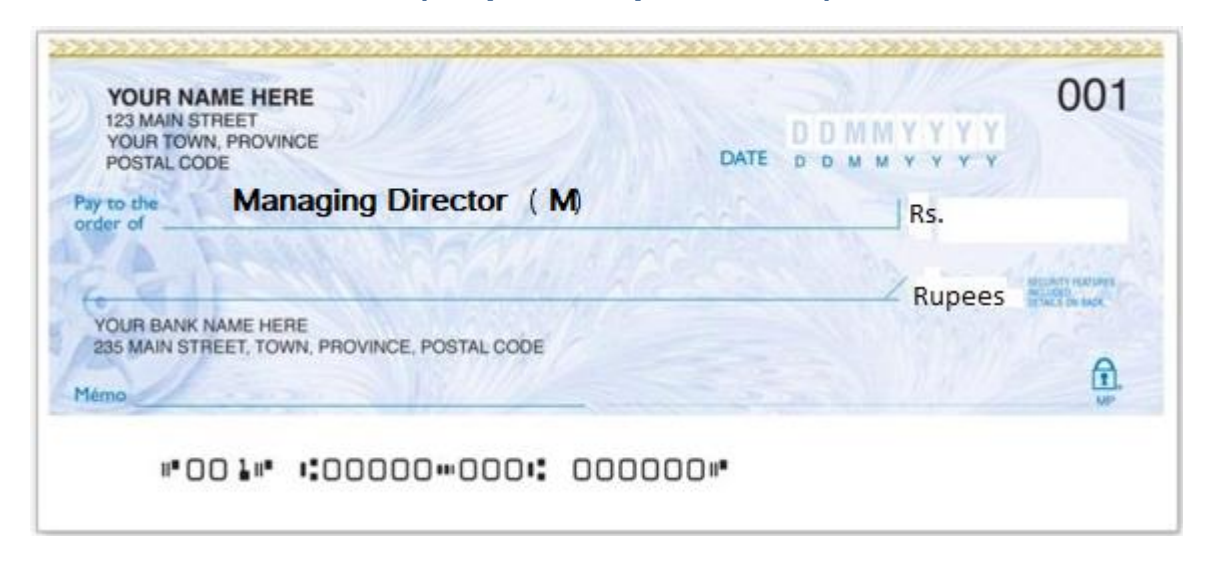
OR (As per Sample of CDR)