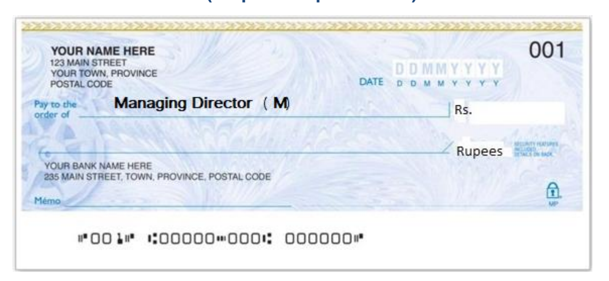
OR (As per Sample of CDR)