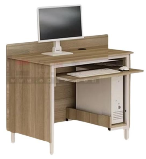
Table for Lab Type - A